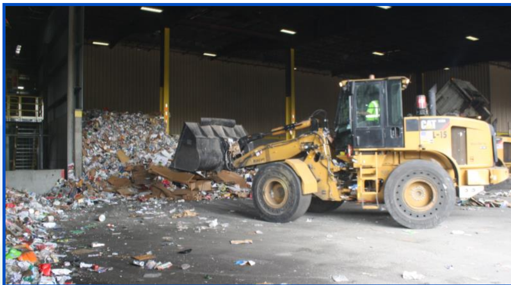
The loader operator gets ready to scoop recyclables up into the drum feeder. The MRF tip floor is a busy place!

The Quarterly Municipal Meeting originally scheduled for March 16 has been moved to May 3.